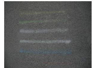
Same paint after being scrubbed with a brush and soapy water